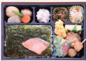
③ Japanese-style bento