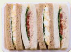
⑥ Sandwich BOX (Tuna & Egg)