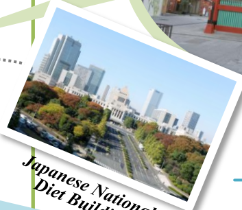
Japanese National Diet Building